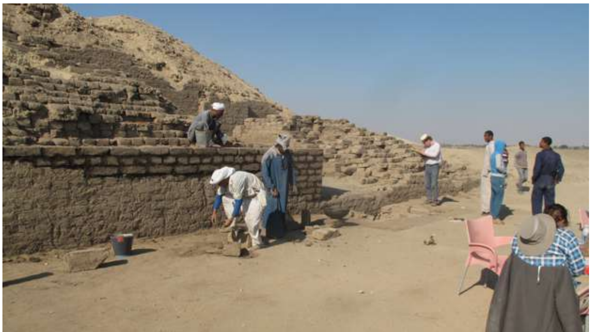
Fig. 5 A layer of geotextile mesh was added between the modern and ancient courses in the “South Palace” restoration.