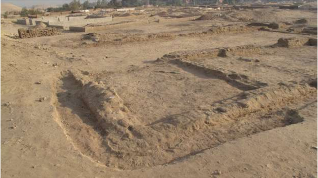
Fig. 7 House A by North Palace being encroached upon by modern cemetery.