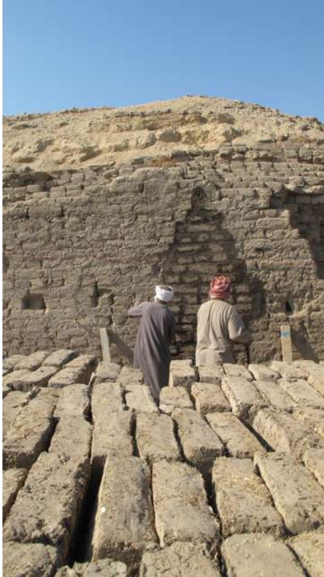
Fig. 3 Façade of the “South Palace” during filling of losses caused by looters.