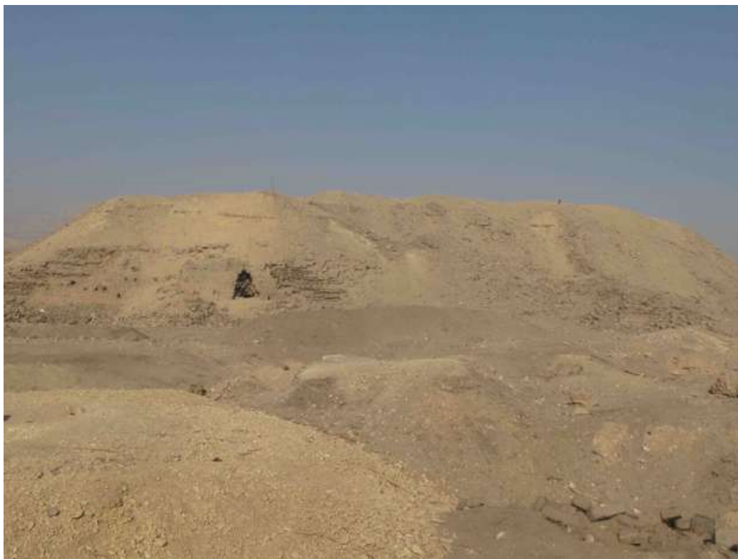
Fig. 2 Façade of the “South Palace” with hole caused by looters at beginning of work in 2018.