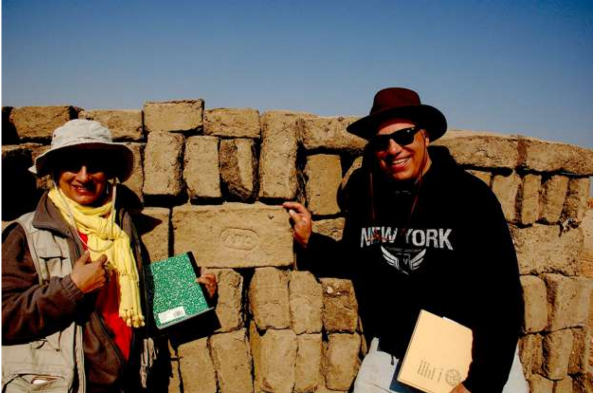
Fig. 4 New mud bricks made for the restoration of the “South Palace.”