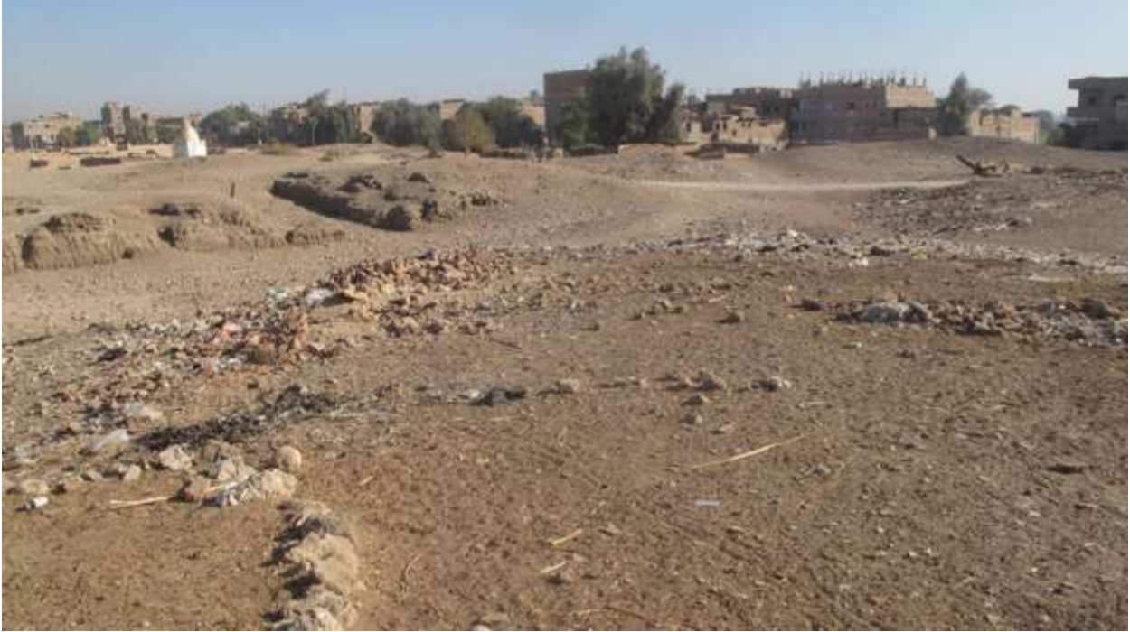
Fig. 6 Modern trash dumped beside the North Palace.