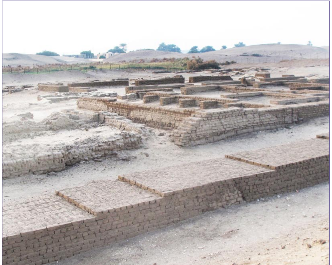
The continuing restoration of the Palace of Amenhotep III at Malqata.