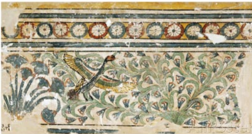
Left: The original floor painting now in the Egyptian Museum, Cairo.