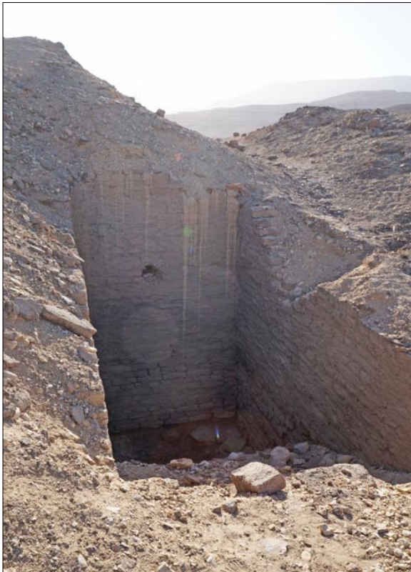
A robbed out casemate at the South Palace, Deir el-Ballas.