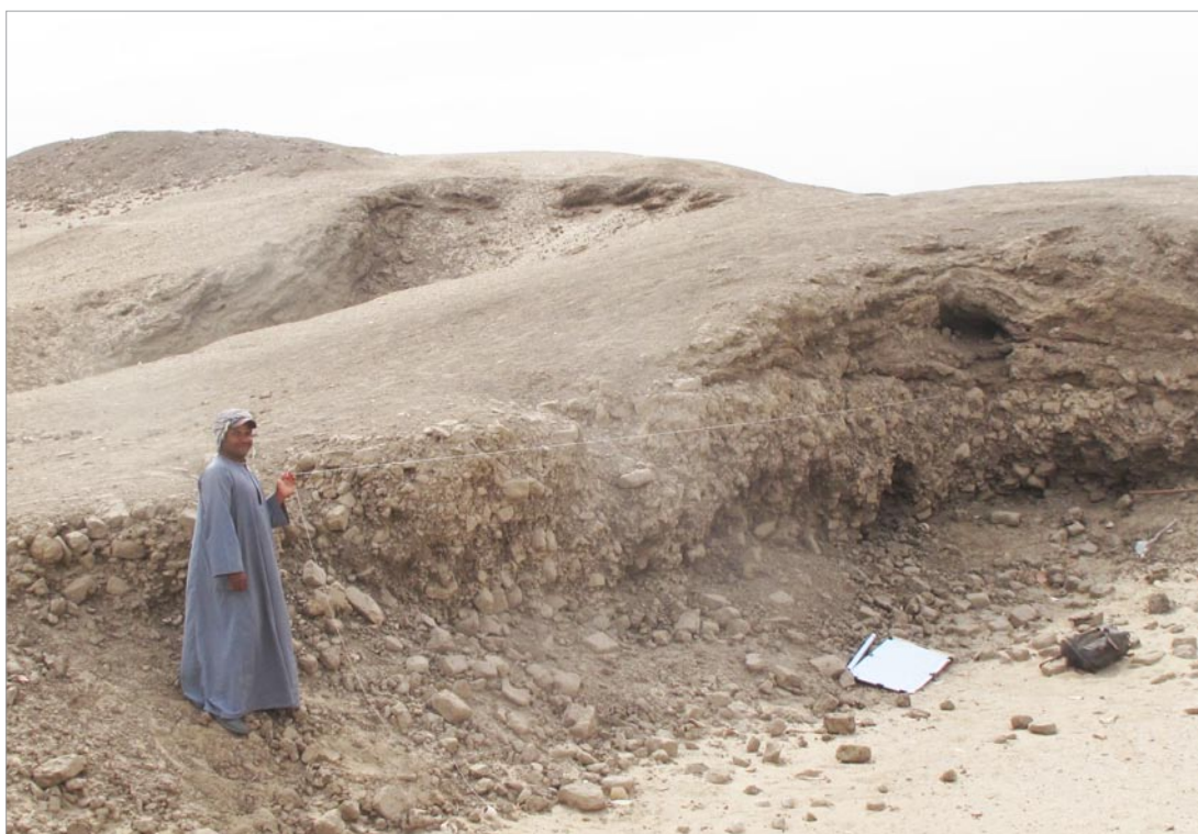
A section at Site K

Thanks to a grant from the Institute for the Study of Aegean Prehistory, we were able to survey an interesting and enigmatic feature of Malqata, a strange outlier to the Birket Habu mounds. Called “Site K” by Barry Kemp, who excavated it in the early 1970’s, the place is a small, mysterious mound. When trenched, it appeared to be filled with material from the destruction of a palace decorated with murals on mud plaster. The contents of the mound were sampled and found to contain not only remains of painted decoration similar to that in the King’s Palace where we are working, but also fragments with much more clearly Aegeanizing motifs, such as the “rosette terrain” and wild plants in a rocky landscape, which bring to mind paintings like those found on Santorini and Crete. To get a better idea of Site K and how it relates to the rest of Malqata, several sections were drawn through Kemp’s old trenches, which are still visible. These trenches will also be tied into the work of Angus Graham of The Egypt Exploration Society Theban Harbours and Waterscapes Survey, who is making a study of the Birket and the other harbors in the Theban area.