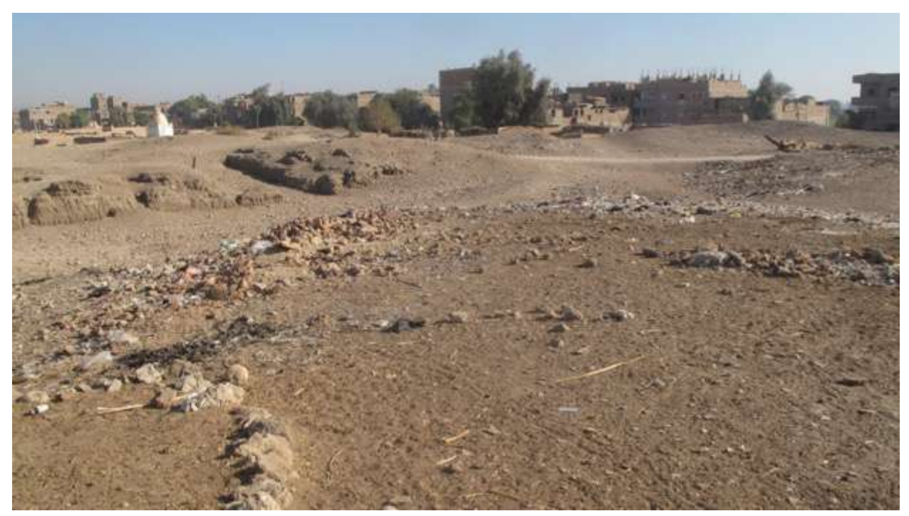
Fig. 6 Modern trash dumped beside the North Palace.