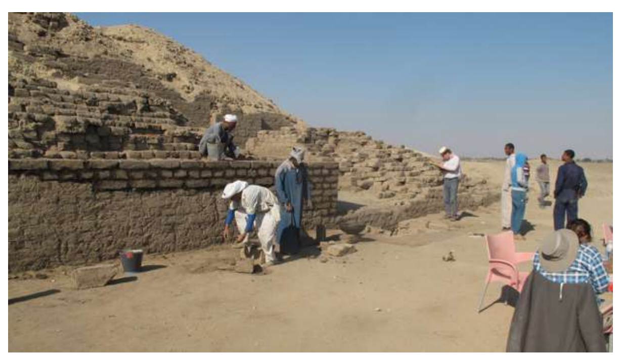
Fig. 5 A layer of geotextile mesh was added between the modern and ancient courses in the "South Palace" restoration.