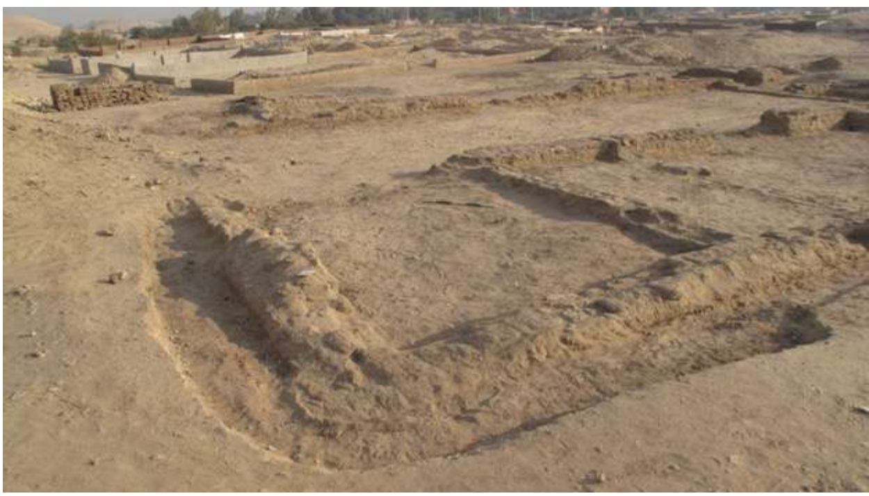
Fig. 7 House A by North Palace being encroached upon by modern cemetery.