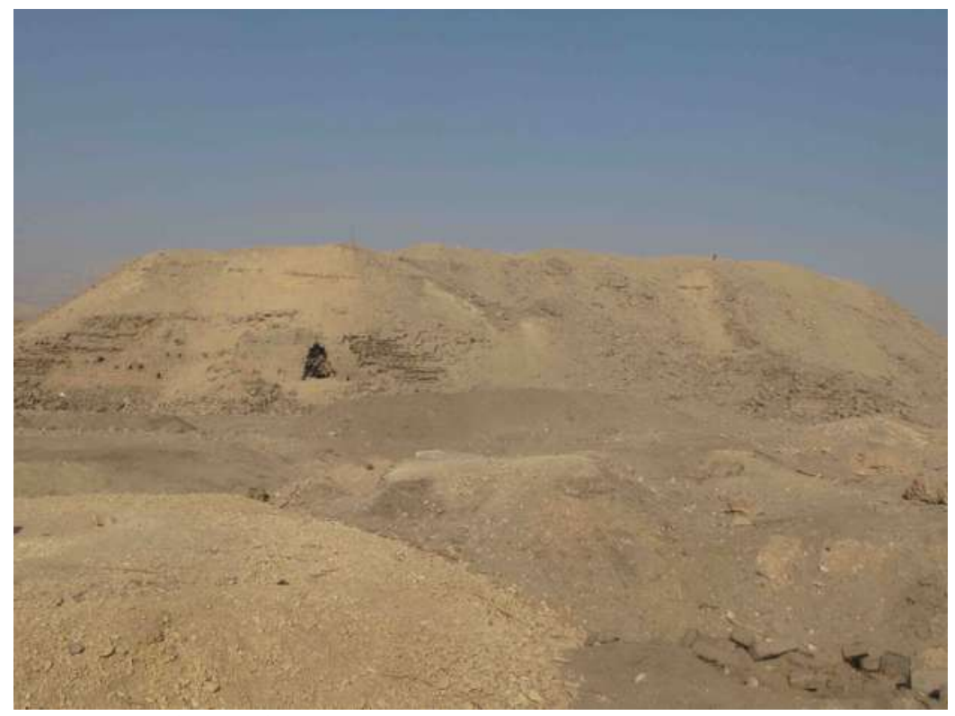
Fig. 2 Façade of the "South Palace" with hole caused by looters at beginning of work in 2018.