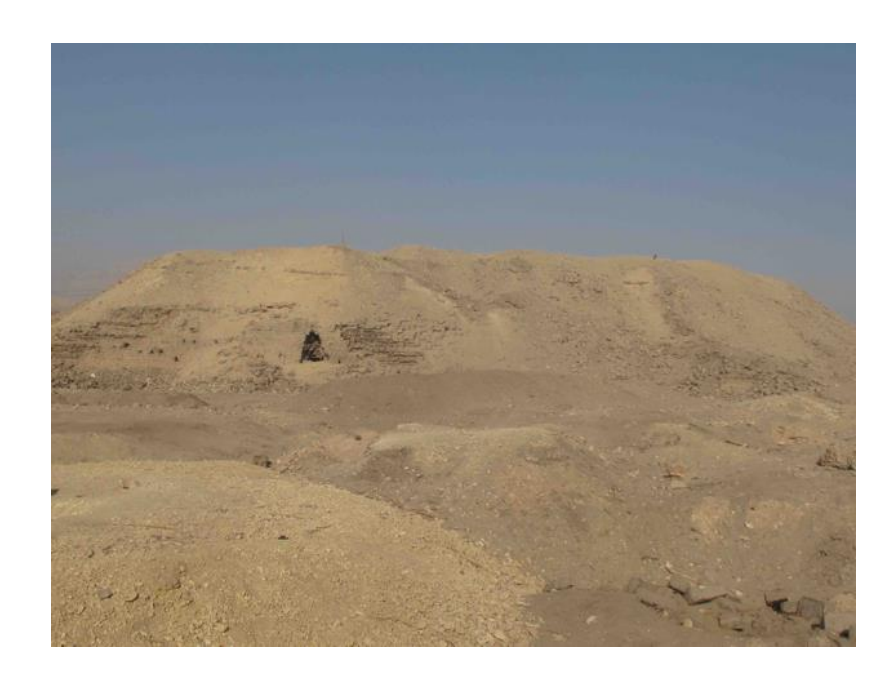
Fig. 2 Façade of the "South Palace" with hole caused by looters at beginning of work in 2018.