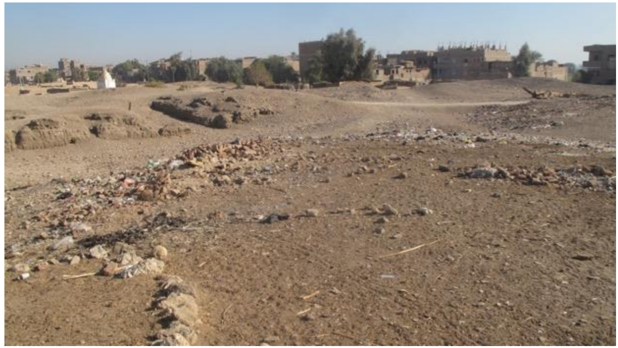
Fig. 6 Modern trash dumped beside the North Palace.