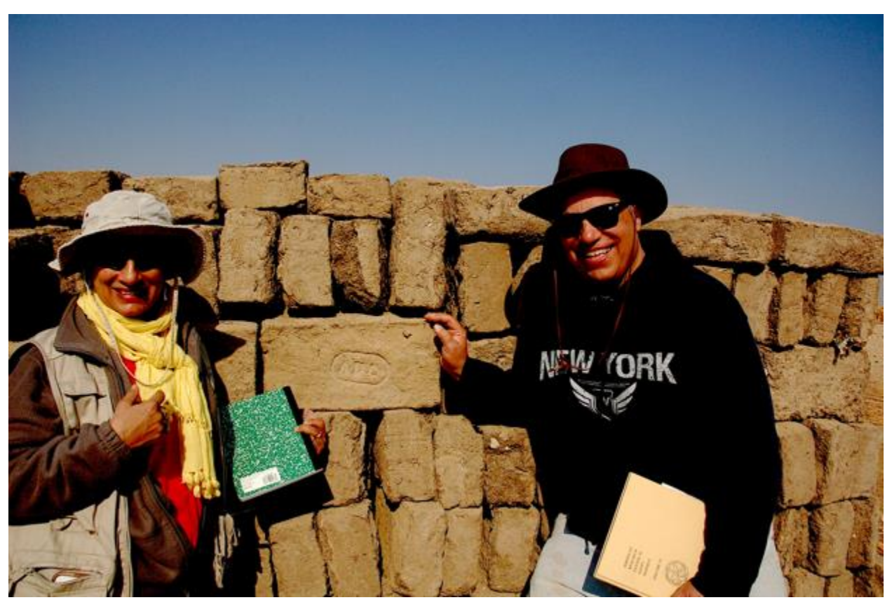
Fig. 4 New mud bricks made for the restoration of the "South Palace."