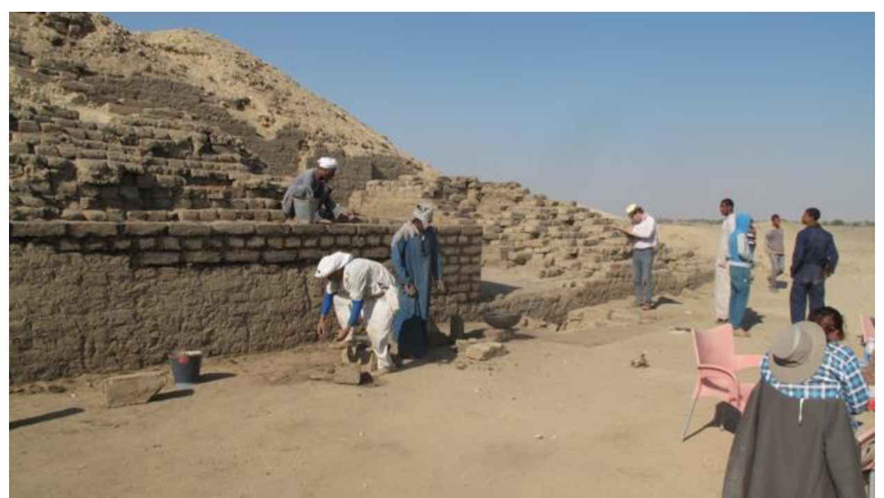
Fig. 5 A layer of geotextile mesh was added between the modern and ancient courses in the "South Palace" restoration.