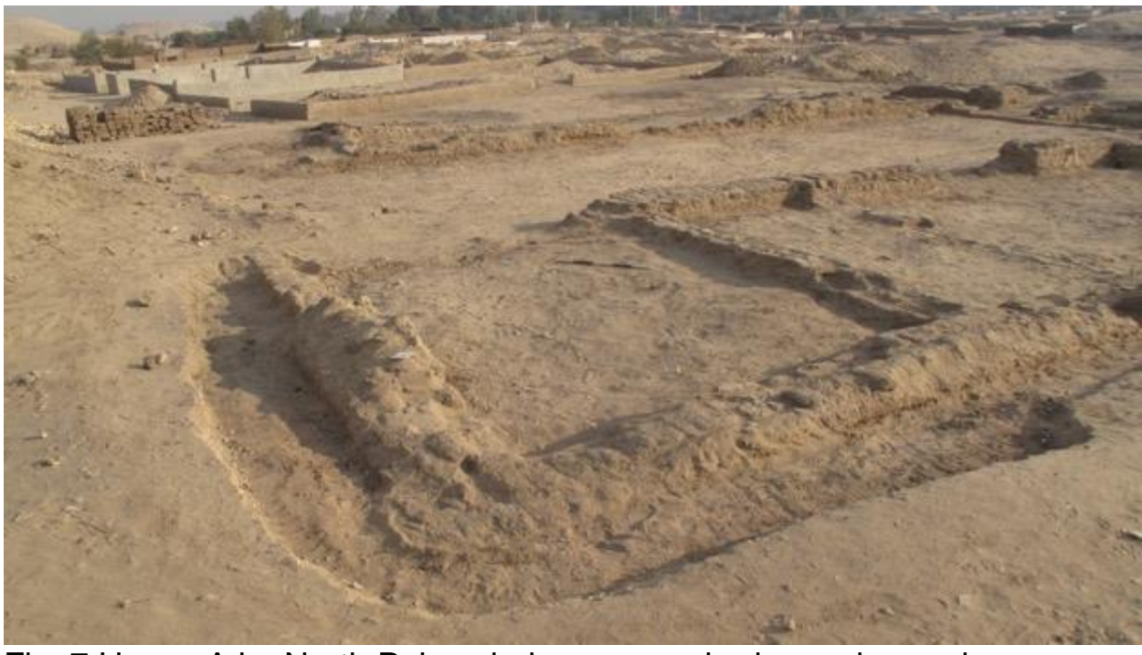
Fig. 7 House A by North Palace being encroached upon by modern cemetery.